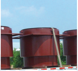
Building Exhaust Stack Silencer