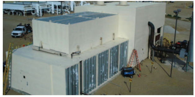
Oil and Gas Noise Enclosure