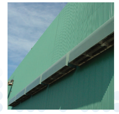
Intake Cowl Silencer for Gas Turbine Building Installation