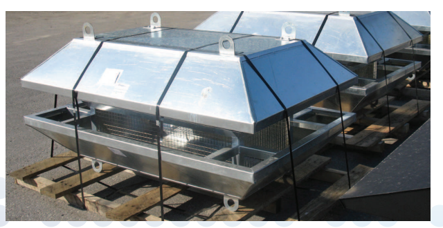
Rectangular Mushroom Hoods