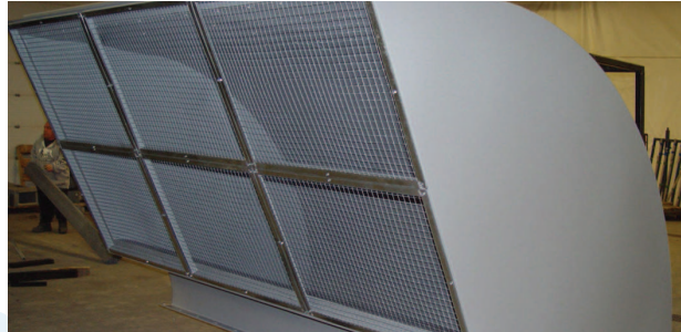
Gooseneck Rainhood with Birdscreen