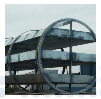
Circular Stack Inlet Silencer